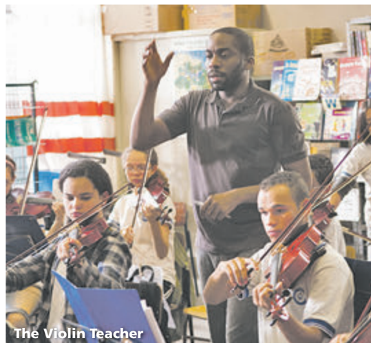
The Violin Teacher