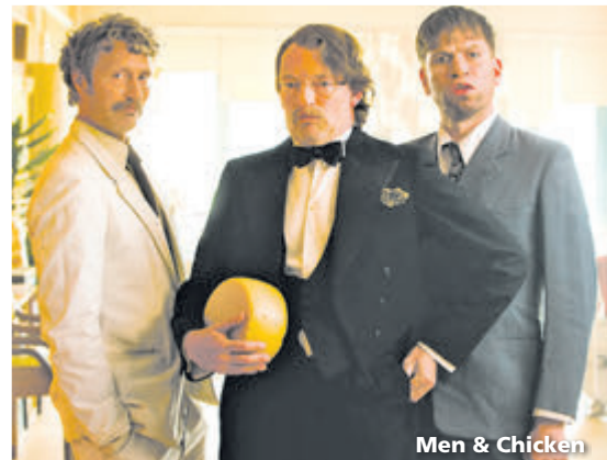
Men & Chicken