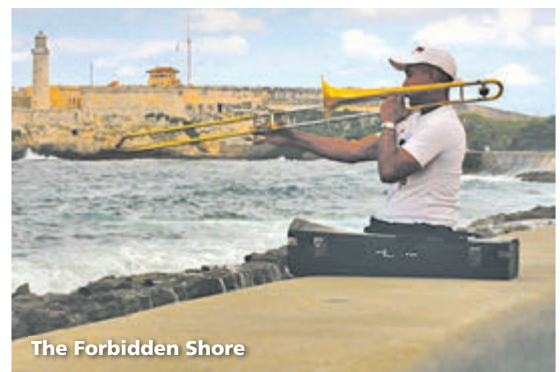
The Forbidden Shore

Founder and Director, Howard Film Culture